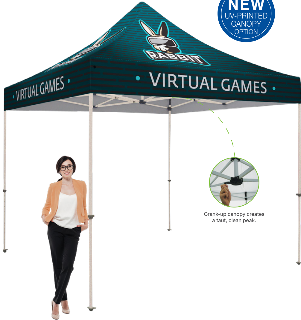
Crank-up canopy creates a taut, clean peak.

Production Lead Time: 4-10 days from final proof approval